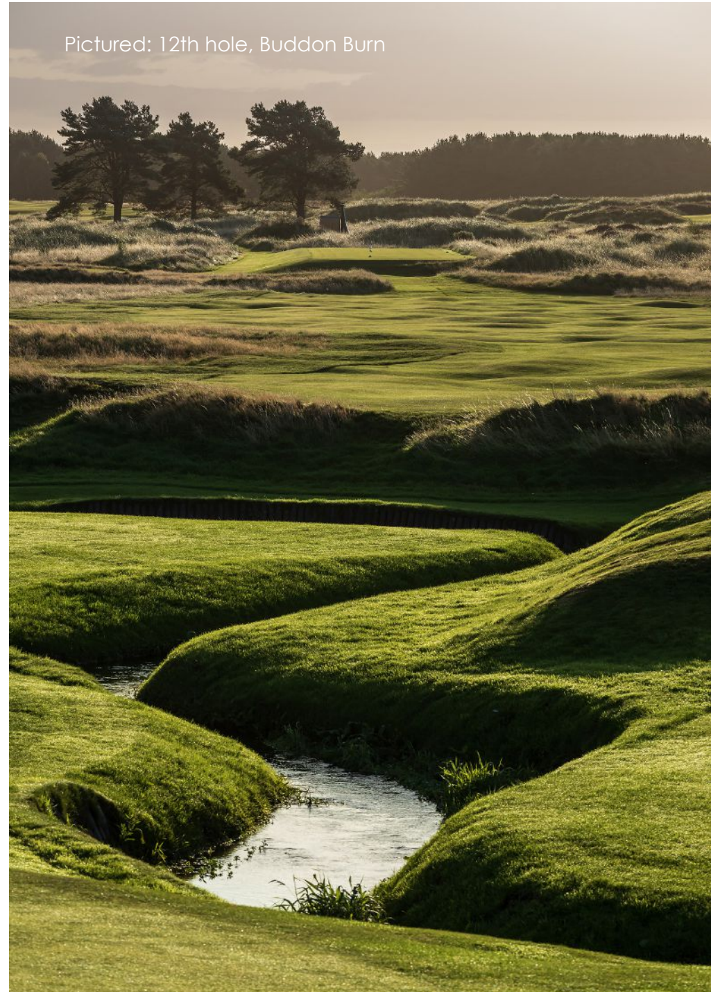
Pictured: 12th hole, Buddon Burn

All coaching sessions need to be booked in advance. Please contact the professional staff to arrange and they will be delighted to discuss your requirements.