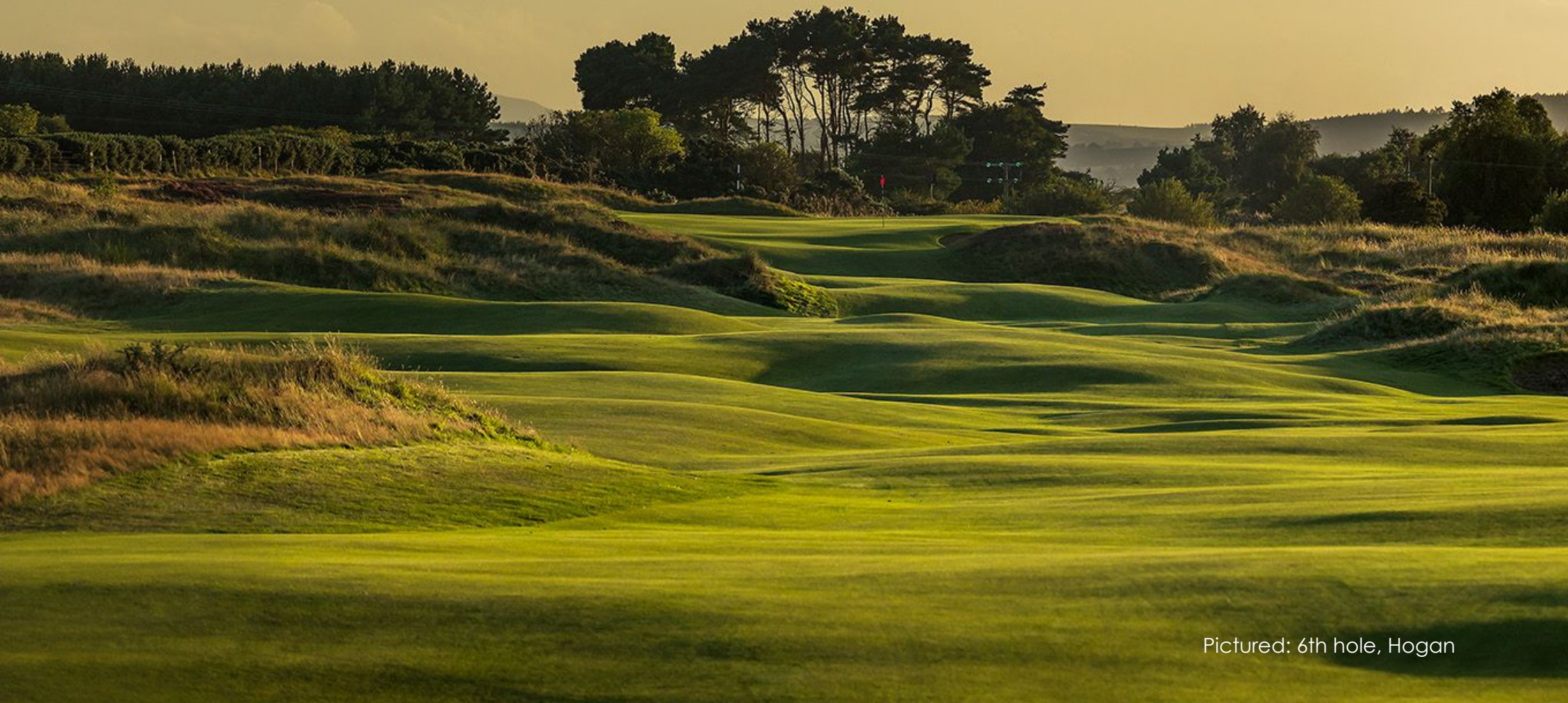
Pictured: 6th hole, Hogan

Hogan would never play in the Open again, but his legacy at Panmure remains! The sixth hole, a 414 yard par 4, stroke index 1, is named after the great man. Hogan suggested the addition of the cleverly-placed hidden pot bunker to the front right of the green. Over sixty seven years on, the members still refer to it as "Hogan's Bunker".