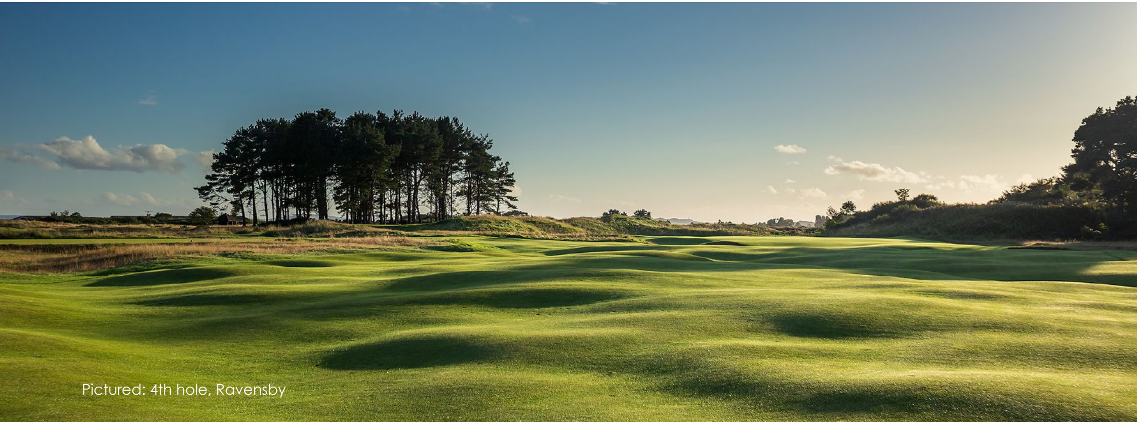
Pictured: 4th hole, Ravensby