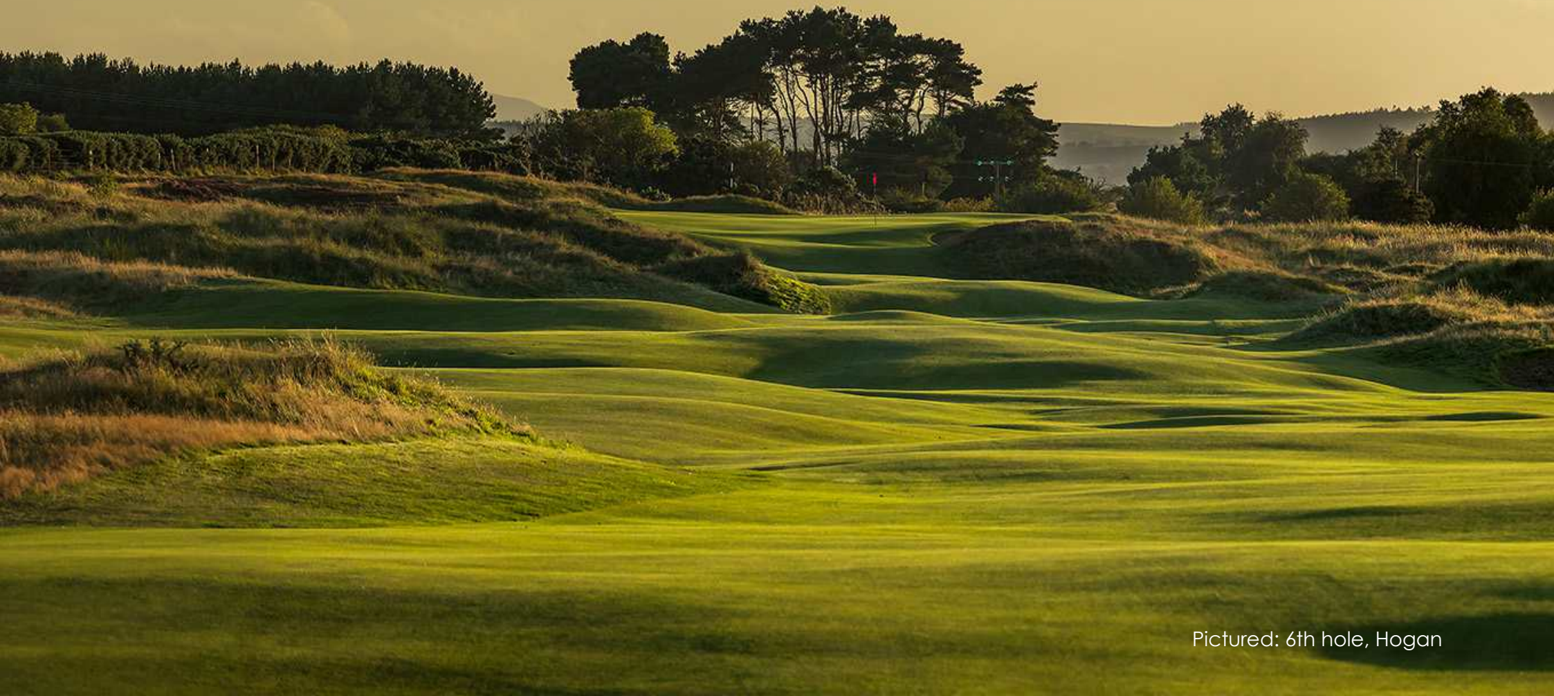
Pictured: 6th hole, Hogan

Hogan would never play in the Open again, but his legacy at Panmure remains! The sixth hole, a 414 yard par 4, stroke index 1, is named after the great man. Hogan suggested the addition of the cleverly-placed hidden pot bunker to the front right of the green. Over seventy years on, the members still refer to it as "Hogan's Bunker".