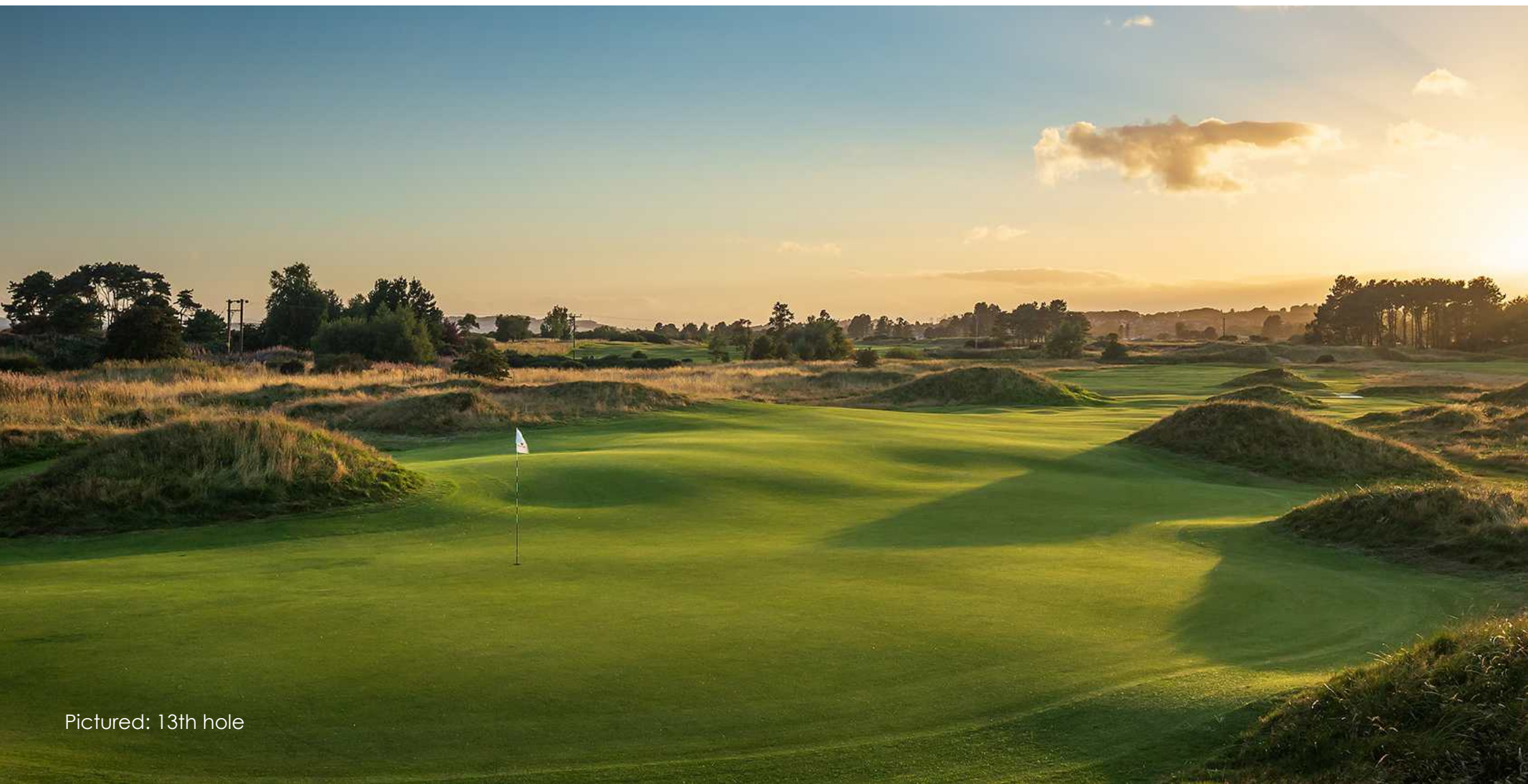
Pictured: 13th hole

We are committed to ensure all members and guests receive the finest experience in golf and hospitality and our core duty is to surpass the expectations of members and guests with quality customer service that leaves a lasting and memorable impression.