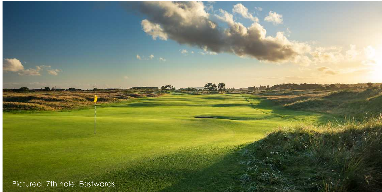
Pictured: 7th hole, Eastwards

The professional team will also provide you with the locker room access code which also works for the on course toilets, located beside the 4th / 16th tees and between the 6th green and 7th tee.