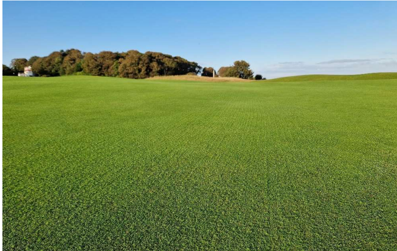
Figure 2: Fescue popping on the 15 th Green.

I am aware of some negative comments regarding the greens, but I must reiterate the point that is a short-term pain for a long-term gain. As I spoke about in the Discussion Panel evening we held in March, if we do not build the correct foundations, ultimately our objectives will fail. Without the ability to store materials for most of the year, we haven't been able to put out the amount of topdressing we normally would which would have helped with the smoothness and trueness of the green's surfaces. We have now started stockpiling sand and will look to regularly topdress through the winter when conditions allow.