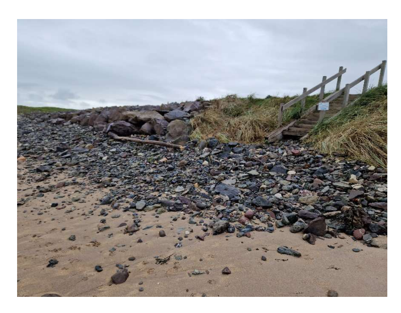
Figure 3: Burst rock-filled gabions beside the Rock Armoury at the 2<sup>nd</sup>.

There was also sand blown onto the 1<sup>st</sup> fairway beside the walker's path which required a bit of tidying up to get rid of the seaweed.