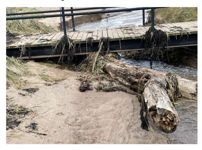
Figure 1: Tree trunk obstructing the flow of the Eel Burn

Storm Babet started on the 19<sup>th</sup> of October and although the worst of the rain in Scotland missed us, the damage from the sea made the biggest impact. The Coastal Erosion zone at the back of the 11<sup>th</sup> green was relatively unscathed and had the usual bit of sand receding that we get every year, some tree trunks blocking the flow of the Eel Burn at the walker's bridge and a large amount of sand deposited in the Eel Burn from the high tide.