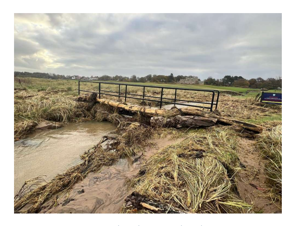
Figure 8: Debris obstructing the Eel Burn.

The dune along the 3<sup>rd</sup> has received the worst damage over the weekend with the dune eroding right up to the right side of the 3<sup>rd</sup> tee. The rock-filled gabions in this area have burst and the high tides have now further eroded this section. We have roped this area off to ensure members, visitors and the general public keep away from this unstable ground.