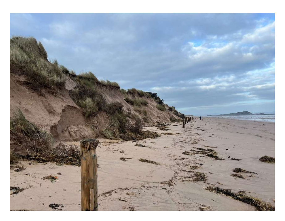
Figure 5: Further up the coastline, this area has receded a lot as the sand used to go up to the fenceposts.