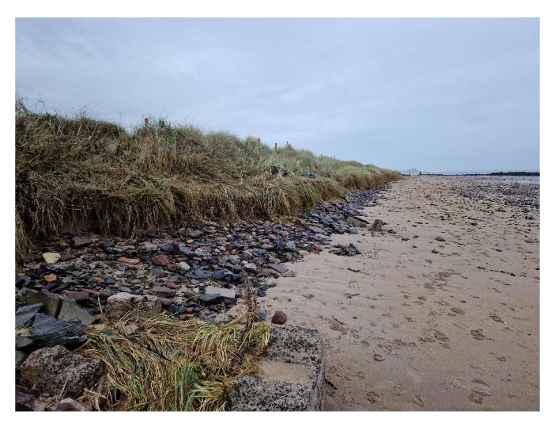
Figure 2: Burst rock-filled gabions along the 3<sup>rd</sup>.

The dune along the 3<sup>rd</sup> hole received some damage with some of the rock-filled gabions bursting and depositing the rocks on the beach. There was a bit of dune damage but nothing at that moment which was too concerning.