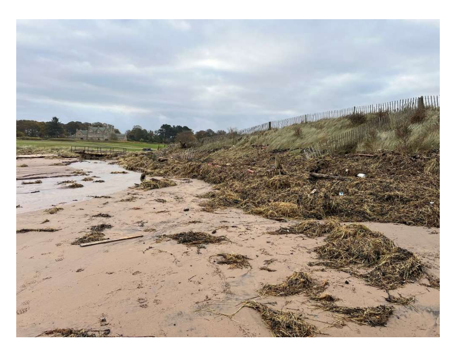
Figure 7: The Eel Burn snaking off the left of its normal path.