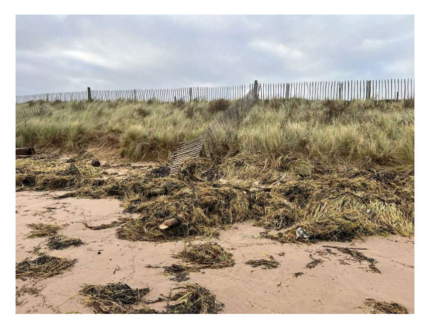
Figure 4: The Coastal Erosion zone at 11.

The Coastal Erosion zone on 11 has receded at the bottom with the high tide line visible on the marram grass. The area adjacent area to the Coastal Erosion zone and further up the dune has receded a lot after building up quite a lot over the past few years. The flow of the Eel Burn has snaked off to the left which is also damaging/threatening to the Coastal Erosion zone. There are more big tree trunks obstructing the flow of the Eel Burn and more sand has been deposited in the burn. Using our digger, our team do their best to tidy this area and allow the Eel Burn to flow as freely as possible.