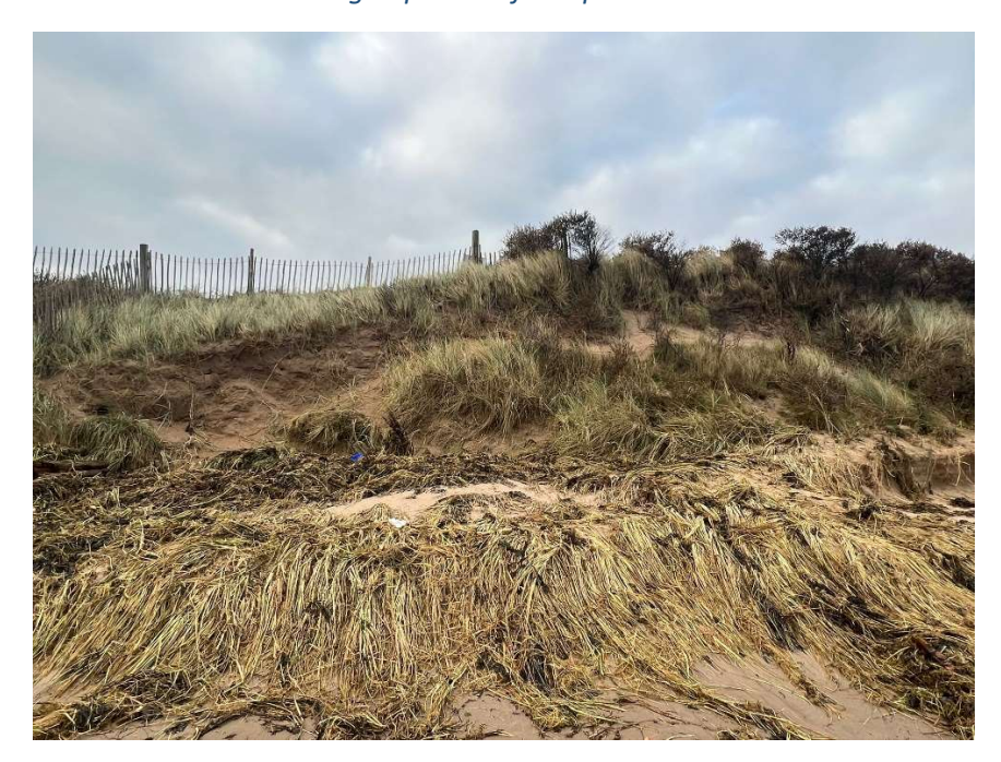
Figure 6: Area adjacent to the Coastal Erosion zone.