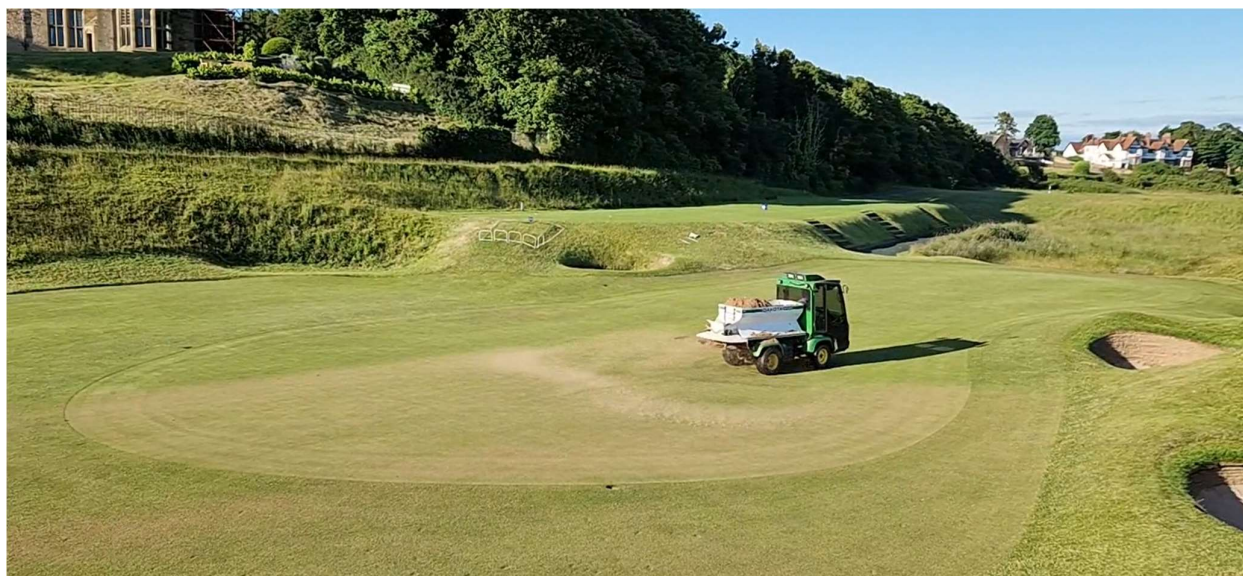
Figure 1: Topdressing in action on the 4th Green

After taking a break for the Club Championship weekends, topdressing greens restarted on the 17 th of June, and we have now top-dressed all the greens and approaches 5 times applying approximately 180 tons to date. The “little and often” approach will make a big difference to both the overall health of the greens, helping to dilute the thatch layer, but also for playability by levelling out any uneven areas and improving ball roll. We are now undertaking weekly light weekly verti-cutting which helps to cut any lateral growth on the greens and to further refine the surface to improve ball roll. We are also at the time of year when ryegrass stalks are popping up around the course and by verti-cutting greens, we will start to cut a lot of these down.