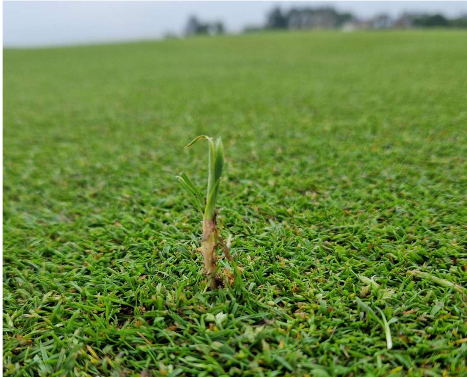
Figure 2: Ryegrass stalk growing on a green.

The reason our mowers cannot catch them is that the stalks are so long, the front roller on the cutting unit flattens it and there is not enough space for the stalk to spring back up in time to be cut by the cylinder cutting blade. We are now in the process of converting our old fairway mowers units into verti-cutting units which will help to keep these stalks down going forward.