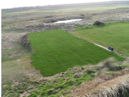
The new tee at the 10 th hole.

Most of the bunkers have now been renewed over the last couple of years with steps put in place or renewed. And finally the rain gave up and the lads were able to get the turf down on the new and extended tees. All in all it has been a splendid effort.