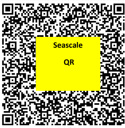
Seascale Golf Club