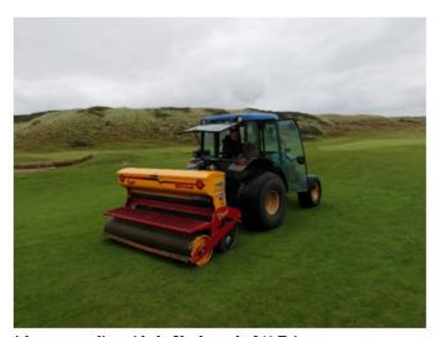
Adam overseeding with the Vredo on the 14th Fairway.

High Footfall Areas - With the increased play we have been left with worn areas on the approaches to paths. We aim to drill 100kgs of a Dwarf Rye mixture into these areas. Dwarf Rye is more resistant to traffic and will be a much hardier alternative to our native Fescue which suffers through over-use. We have also sent a correspondence out to all members highlighting their use of buggies and trolleys and to try and alleviate some damage.