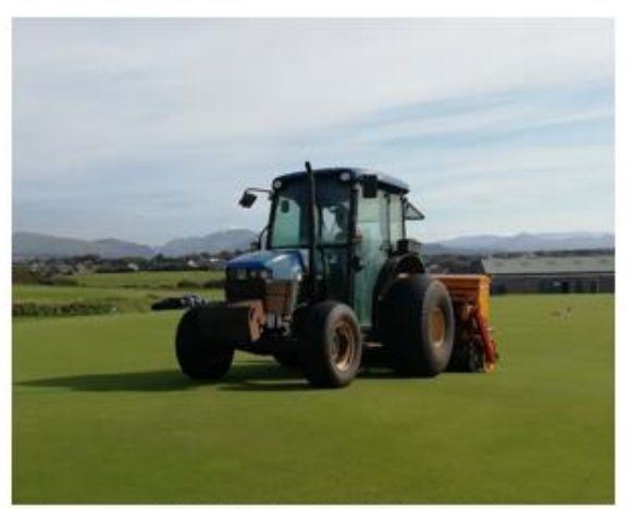
Overseeding with the Vredo on the 18th Green.