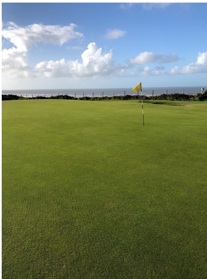
Photo taken after renovation showing our high percentage of Fescue