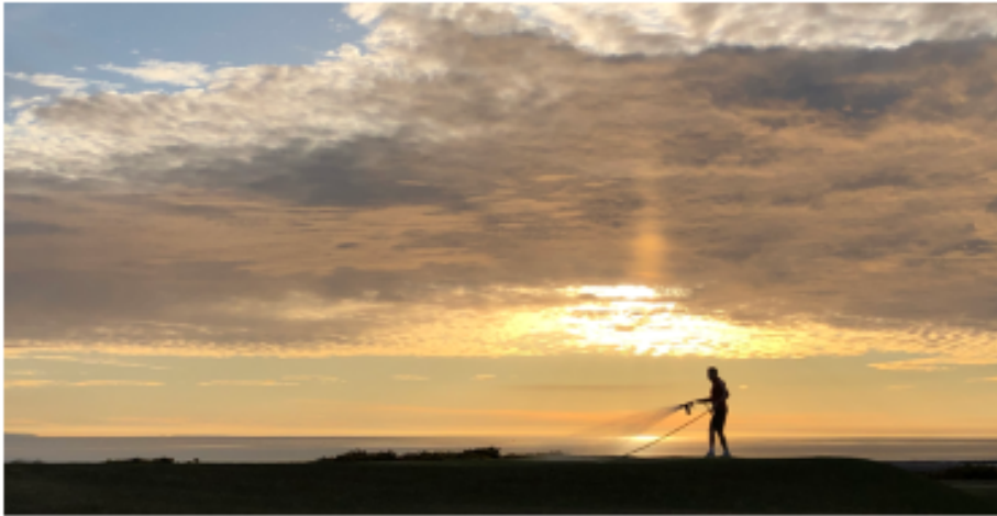
Hand watering at night during an extensive dry spell Lockdown 2020