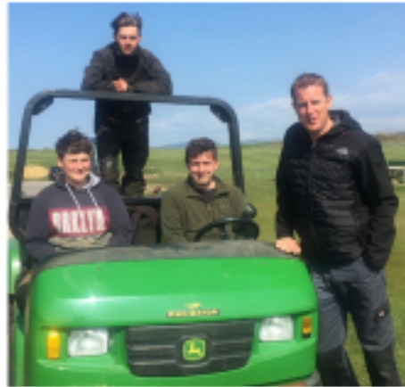
Mid-Summer Madness, 2019