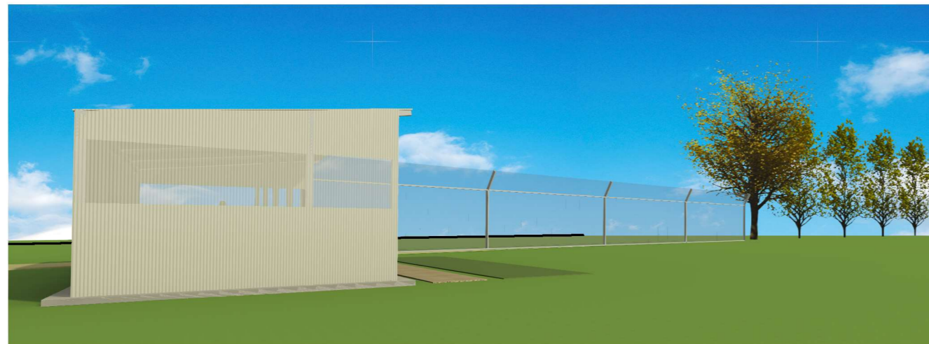
3D View 3