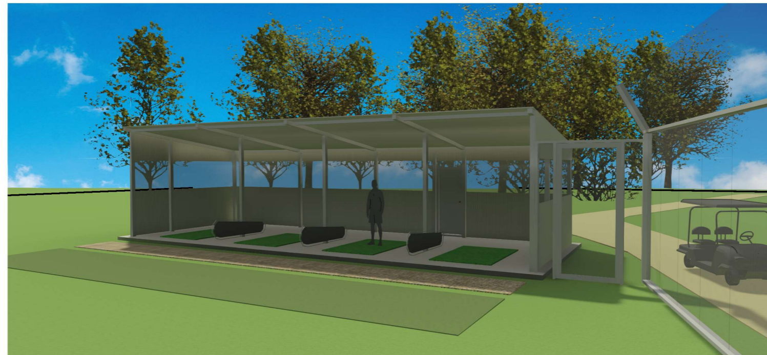
3D View 2